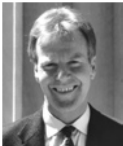
Peter M. Senge